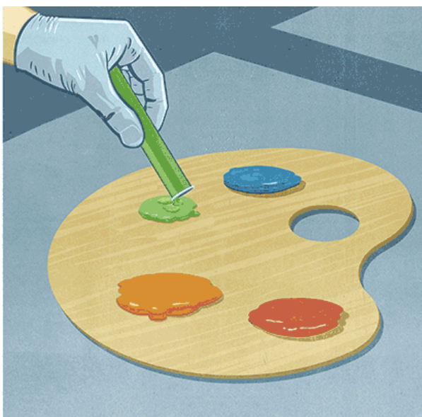
illustration by Shout